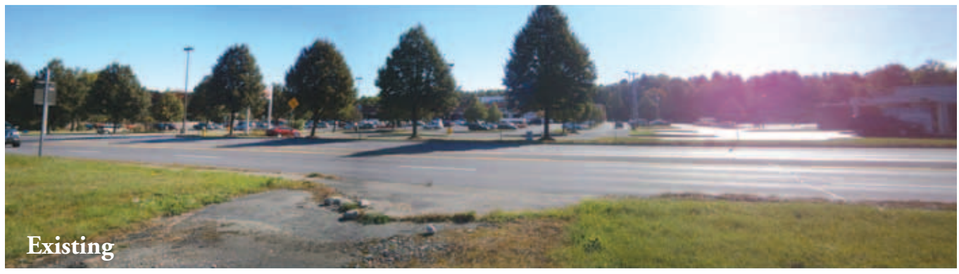
The above renderings illustrate the town's vision for improvements to the Town Center area. Sidewalks, improved lighting and streetscape amenities are proposed, and the Town of Glenville has applied for a $450,000 grant through the Transportation Enhancement Program to help fund this $1.1 million project. NYS DOT will begin sidewalk improvements as part of this plan beginning in 2014.